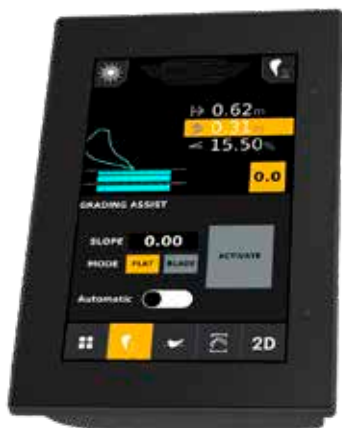
XSITE® SEMI-AUTOMATION PANEL