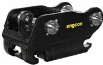
Q-SAFE QUICK HITCH