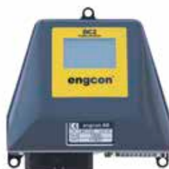
DC2 CAB MODULE