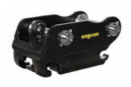
Q-SAFE QUICK HITCH